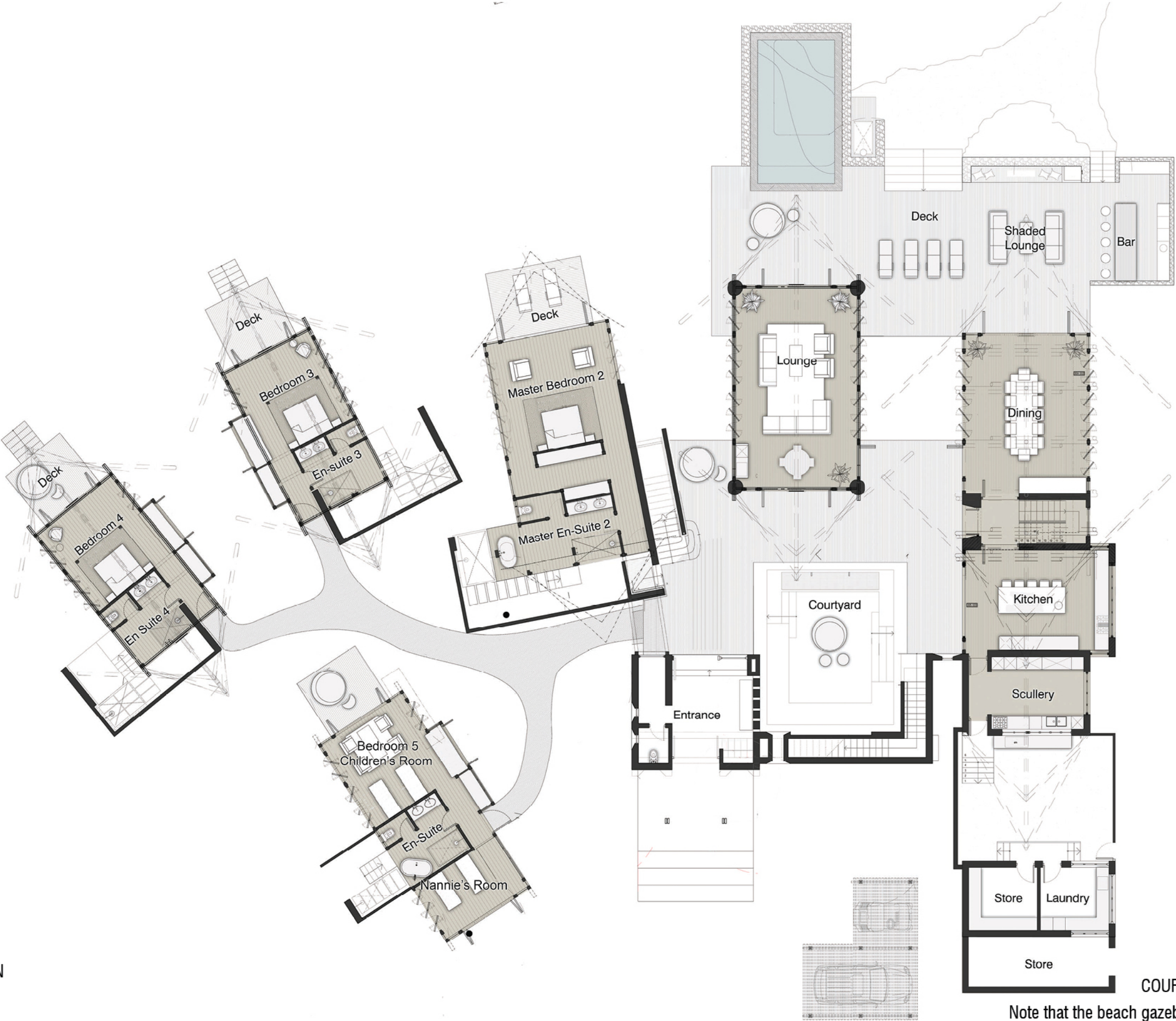
VILLA SULUWILO GROUND FLOOR PLAN

INTERNAL AREA : 698m 2 DECKING : 440m 2 COURTYARDS, GAVEBOS, TOWERS : 190m 2