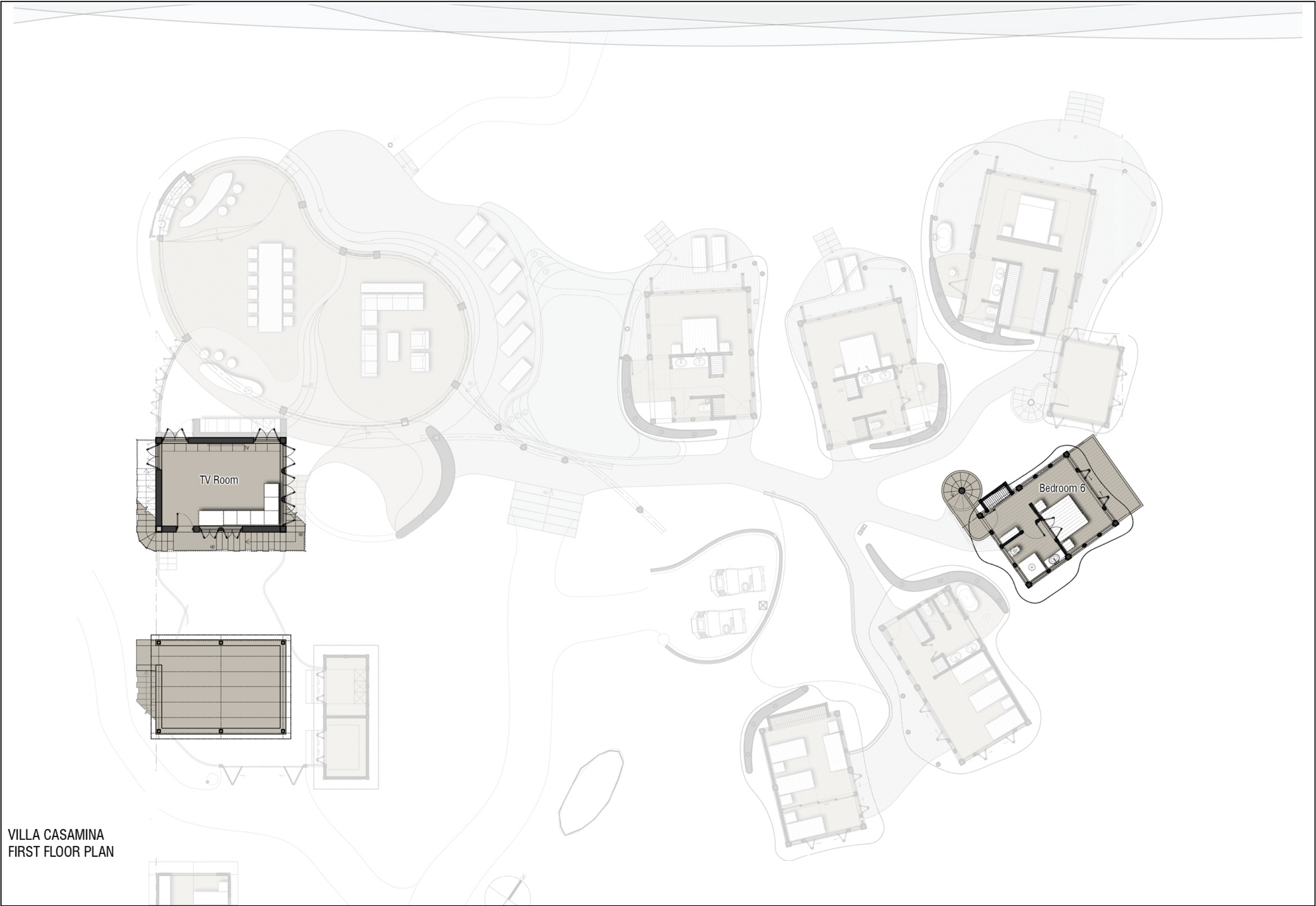
VILLA CASAMINA FIRST FLOOR PLAN