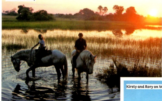
Kirsty and Rory on Vamizi Island