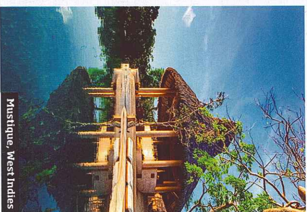
Mustique, West Indies