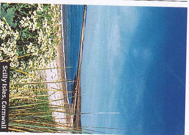
Scilly Isles, Cornwall

When to go Mallorca has a great year-round climate, with a long, often sunny spring and autumn. Summer is less scorching than elsewhere in Spain. Details Villa Josefa is open in 2011 from May 25 to September 7. From £8,145, based on up to eight guests for seven nights, including full board courtesy of a Scott Dunn chef, housekeeper and nanny, but excluding flights and car hire ( scottdunn.com ).