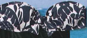
Top £169; bottoms £110, both Eres

'Bikinis by Eres, a long-sleeve white Heidi Klein kaftan so that I can cover up from the midday sun, Sisley sunscreen and Ray-Ban sunglasses.'