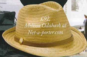
£92, Melissa Odabash at Net-a-porter.com