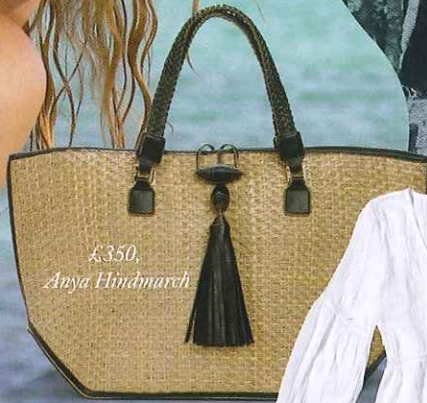
£350, Anya Hindmarch