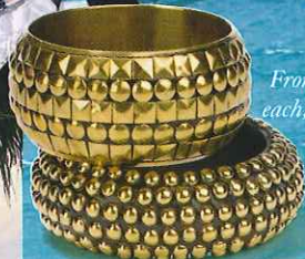
From £90 each, Pebble