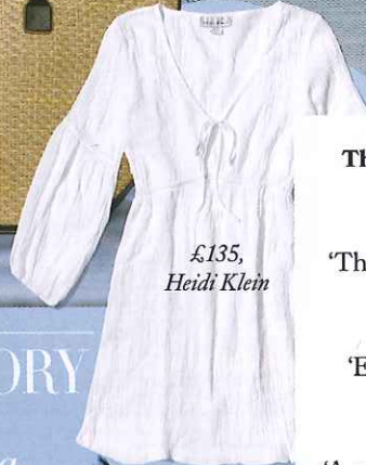
£135, Heidi Klein