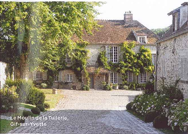
Le Moulin de la Tuilerie, Gif-sur-Yvette