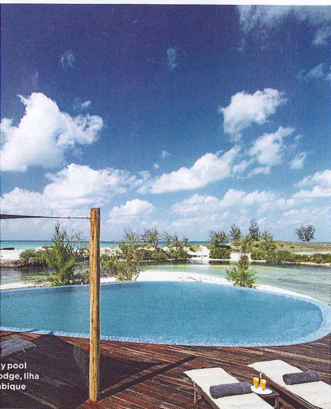
y pool odge, Ilha ambique

DETAILS: Seven nights' full-board at Coral Lodge, including flights, transfers and a complimentary scuba dive, from £3,499 per person, based on two sharing. Seven nights' full-board at Nuarro, including flights, transfers and a complimentary massage, from £2,399 per person, based on two sharing. Both with To Escape To (020 7060 6747, toescapeto.com). Kenya Airways is due to introduce flights from Nairobi to Nampula in January, which should bring prices down.